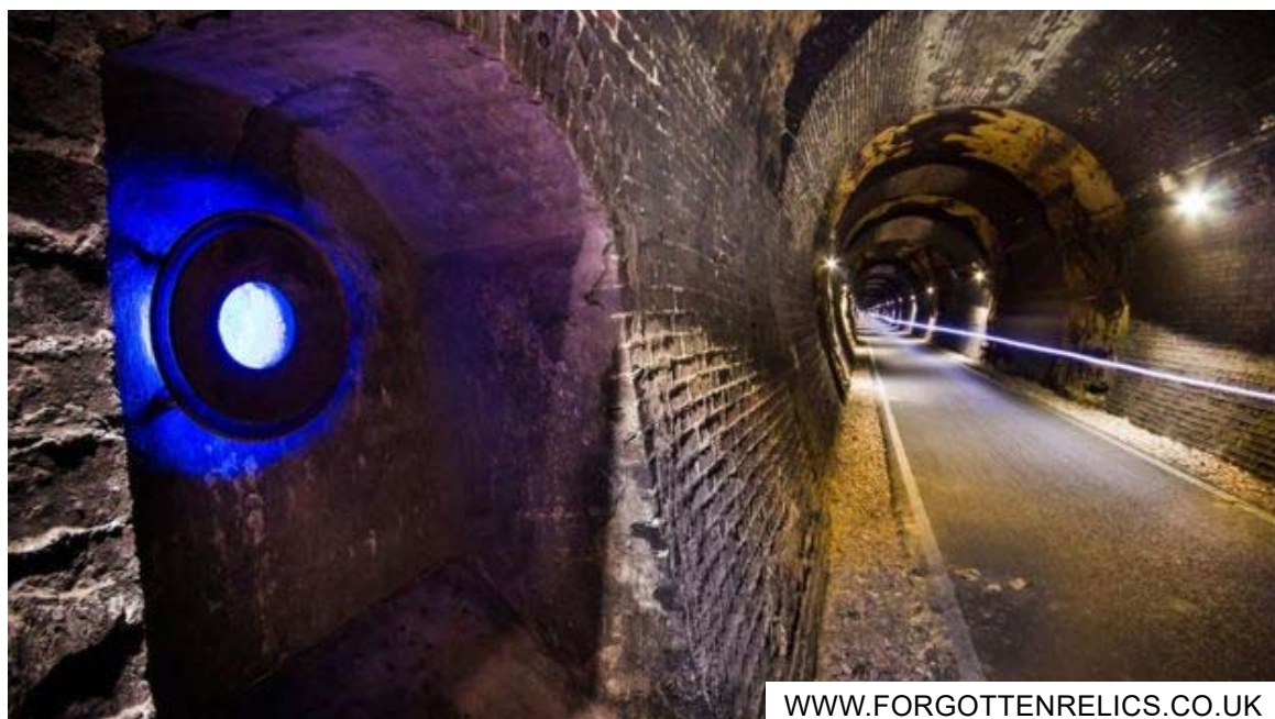
Combe Down tunnel after works