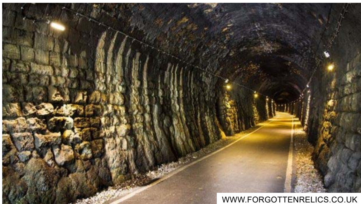
Devonshire tunnel - part of the Two Tunnels Greenway - before works