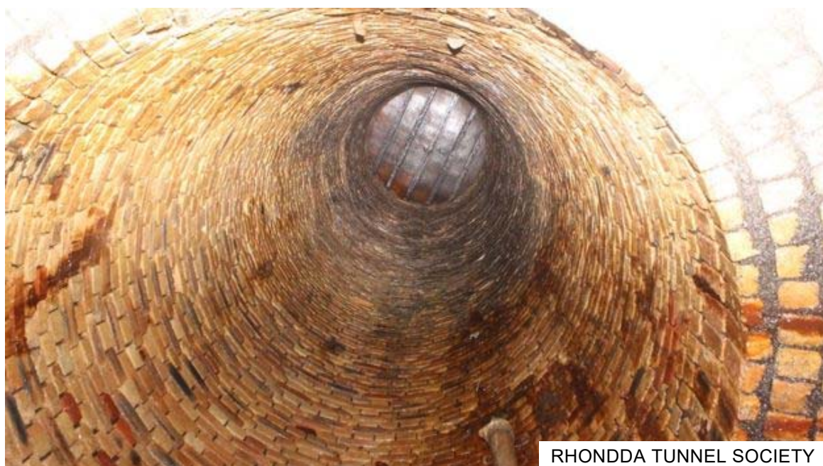
RHONDDA TUNNEL SOCIETY